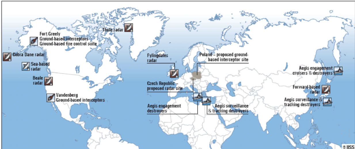
The enlarged US Ballistic Missile Defense System network

Based on a map supplied by the US Missile Defense Agency