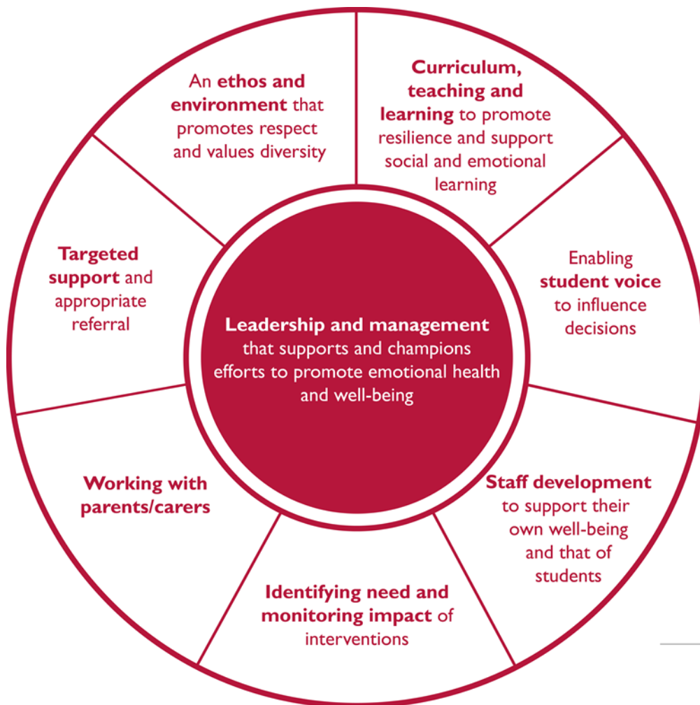
Figure 2: Eight Principles to Promote Emotional Health and Wellbeing in Schools and Colleges